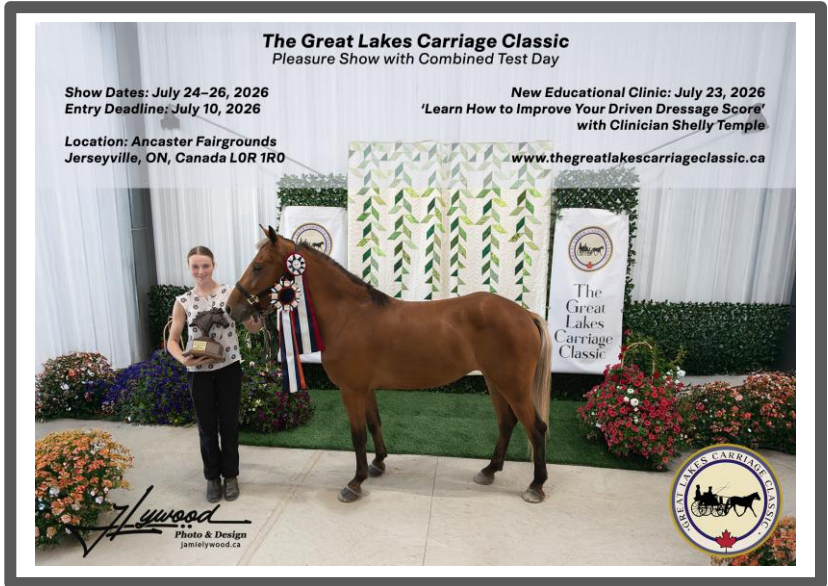
Driving: Luna Surprize, Large Pony, Mixed Breed Winner Junior Division: Audrey Bostwick Memorial Trophy

Ancaster Fairgrounds, Jerseyville, Ontario